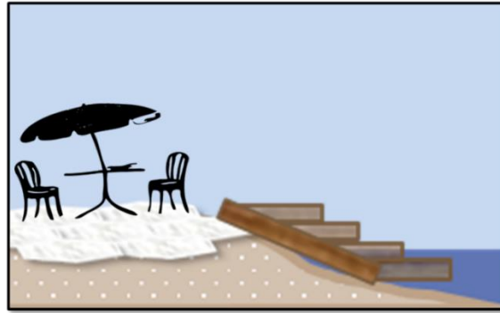
Figure 3 - Access stairs to and from water access structures, viewed as a cross-section.

Stairs made of wood or wood-like materials that are constructed over the existing grade and are removed at the end of the season are the preferred design for access to and from the water, as they typically are the best option to avoid and minimize impacts surface waters and resources (Figure 3). Stairs constructed to and from water access structures must not exceed 6 feet in width, from edge to edge (i.e., maximum total width). If these stairs are installed or constructed to provide access to the water, they must be removed from the lakebed prior to ice-in and not be re-installed until ice-out.